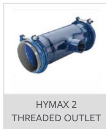
HYMAX 2 THREADED OUTLET