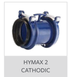
HYMAX 2 CATHODIC