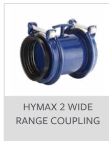
HYMAX 2 WIDE RANGE COUPLING