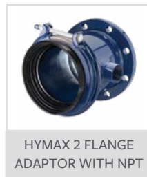
HYMAX 2 FLANGE ADAPTOR WITH NPT

Nominal pipe size 4" - 12" Removable gasket only