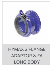
HYMAX 2 FLANGE ADAPTOR & FA LONG BODY