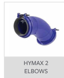
HYMAX 2 ELBOWS