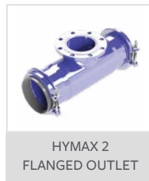
HYMAX 2 FLANGED OUTLET