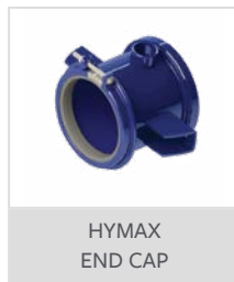
HYMAX END CAP

Nominal pipe size 4" - 12" Removable gasket only