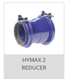
HYMAX 2 REDUCER