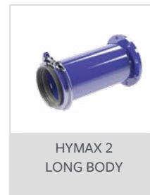
HYMAX 2 LONG BODY