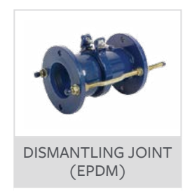
Nominal pipe size 3'' - 24''