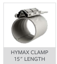
HYMAX CLAMP 15" LENGTH