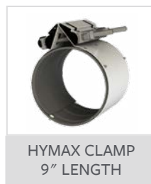
HYMAX CLAMP 9" LENGTH