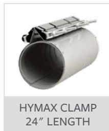
HYMAX CLAMP 24" LENGTH