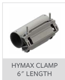
HYMAX CLAMP 6" LENGTH