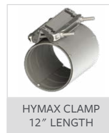
HYMAX CLAMP 12" LENGTH