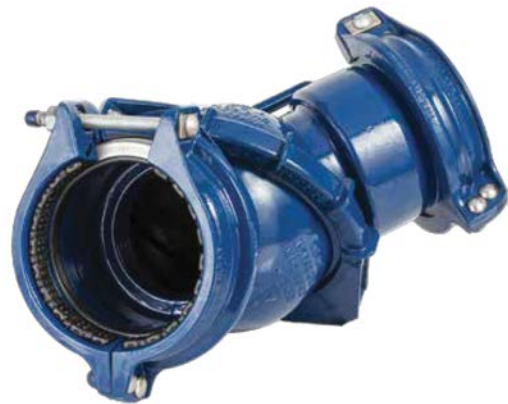
HYMAX GRIP SWIVELJOINT 4" - 12"